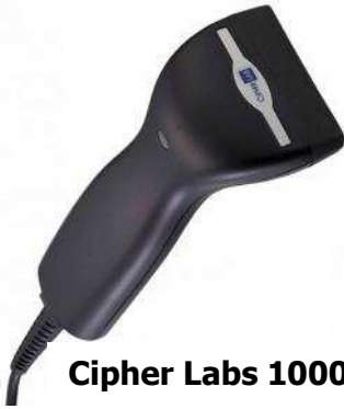
Cipher Labs 1000

The Cipher Labs 1000 has been a time honored favorite among school libraries, it is very tough and can if required be configured to read bar codes without depressing the trigger.