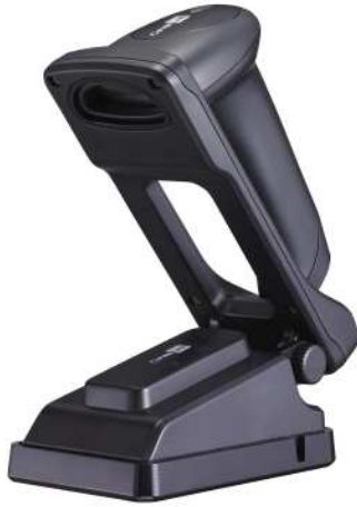
Cipher Labs 1560P

Another favorite time honored portable bar code reader that falls into category (b) and (c) is the Cipher Labs model 1560P at $484.00 Incl GST.